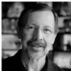
Ed Catmull President of Pixar & Walt Disney Animation Studios