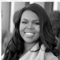
Aja Brown Mayor, City of Compton