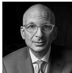
Seth Godin Innovative Thinker & Best-Selling Author