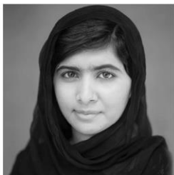
Malala Yousafzai "Bravest Girl in the World" - CNN Live via Simulcast