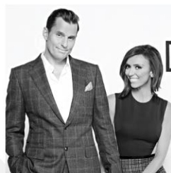
Bill & Giuliana Rancic Award-Winning Personalities & Co-Hosts of Leadercast