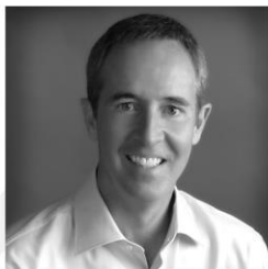
Andy Stanley Leadership Author & Communicator