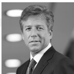
Bill McDermott CEO of SAP AG