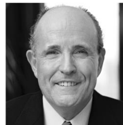
Rudy Giuliani 107th Mayor of New York City (1993-2001)